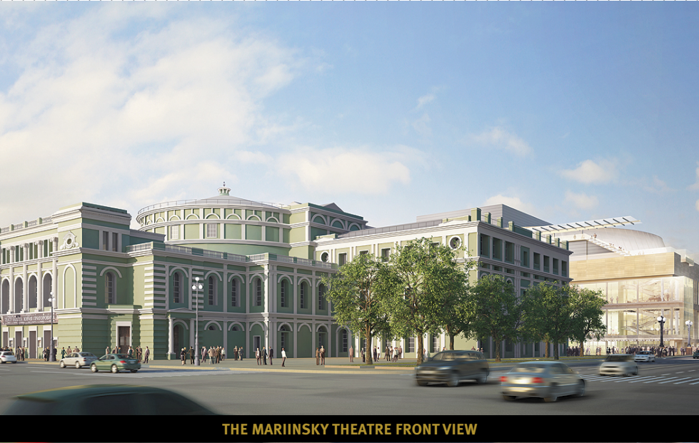
THE MARIINSKY THEATRE FRONT VIEW