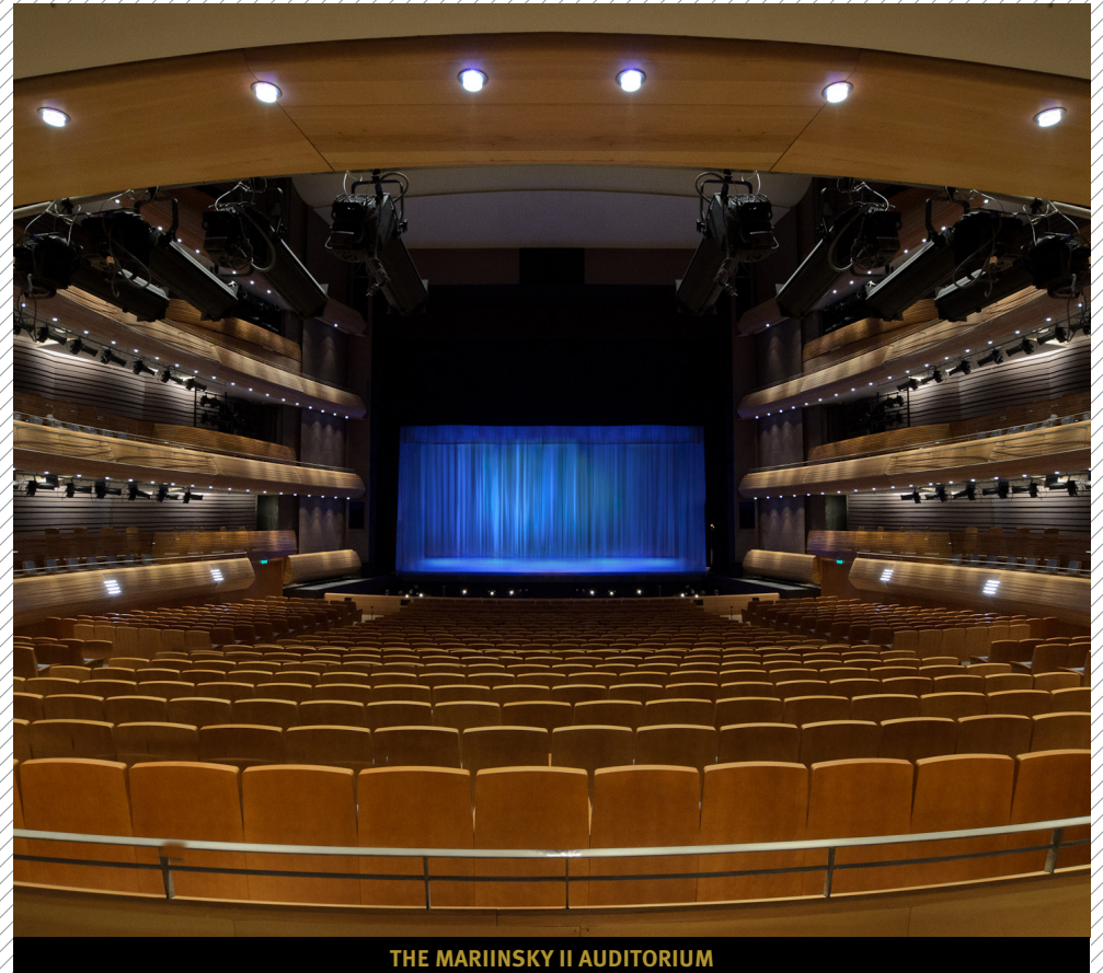
THE MARIINSKY II AUDITORIUM

This expanded Mariinsky Cultural Complex will serve all of the Mariinsky companies, the Mariinsky Opera, Mariinsky Ballet, Mariinsky Orchestra, and the Mariinsky Theatre Chorus, and will enable each of them to offer the public a greatly increased schedule of presentations.