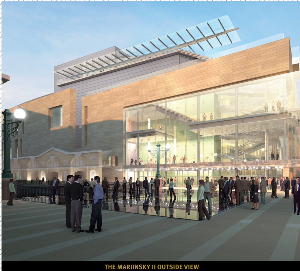
THE MARIINSKY II OUTSIDE VIEW