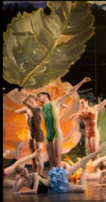
© 2011 by the American Psychological Association or one of its allied publishers. This article is intended solely for the personal use of the individual user and is not to be disseminated broadly.